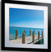
This picture frame is actually the customizable Art Cool Gallery unit!

Air Conditioning Technologies | www.lghomecomfort.com